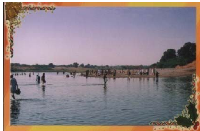
Bhima & Amaraja River

Shri Dattatreya or Datta Guru, an incarnation who came to light the lamp of wisdom among the people.